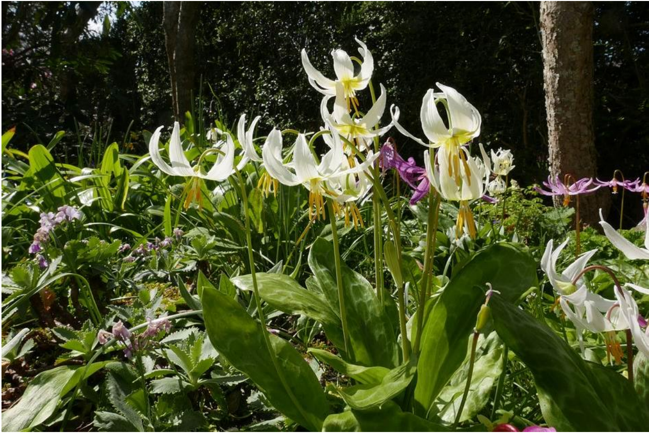
Erythronium oregonum hybrid