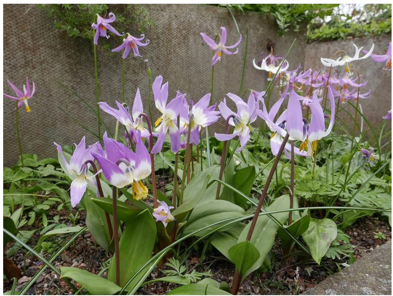
Erythronium sibiricum complex