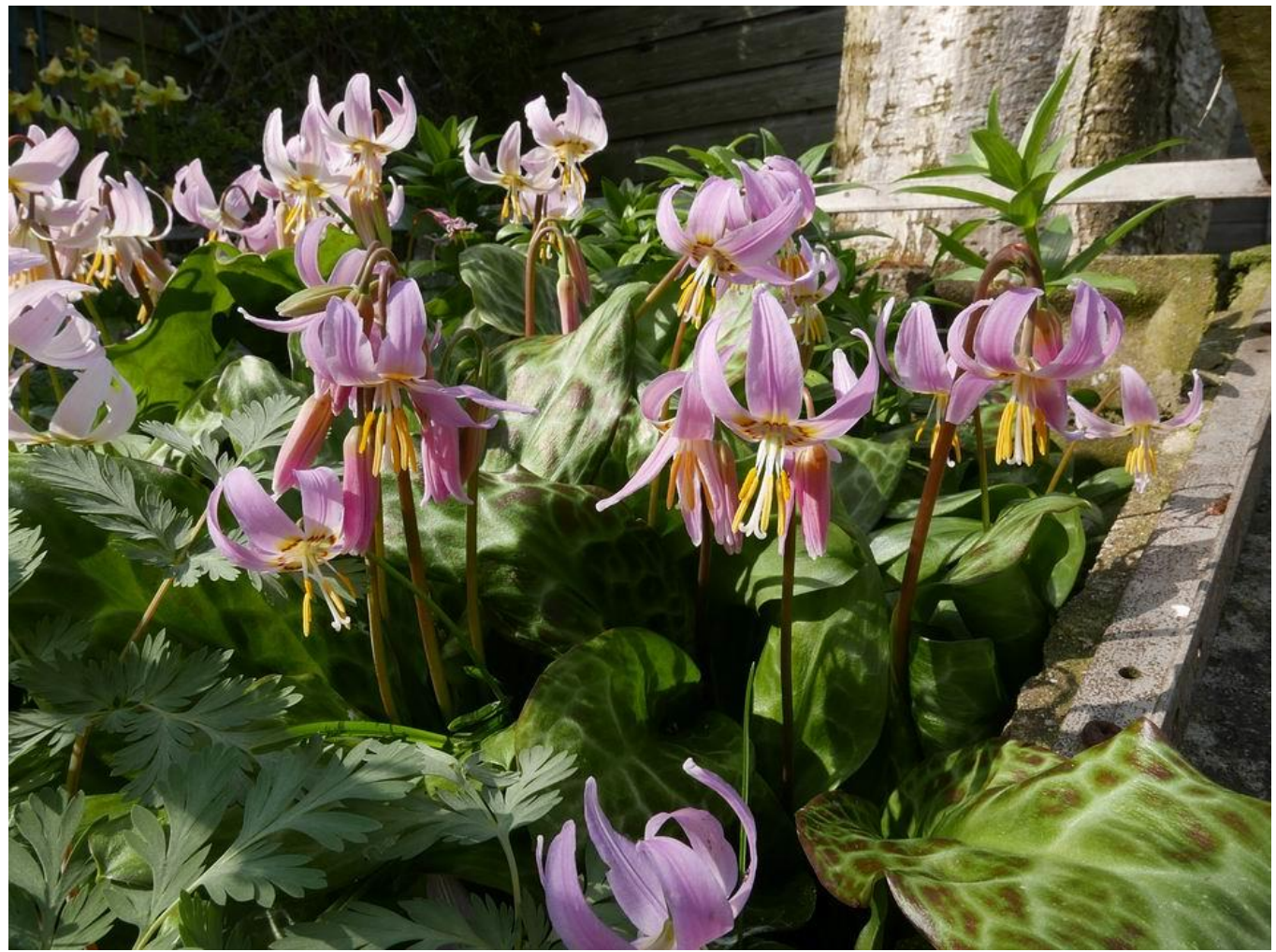
Erythronium revolutum hybrid 3