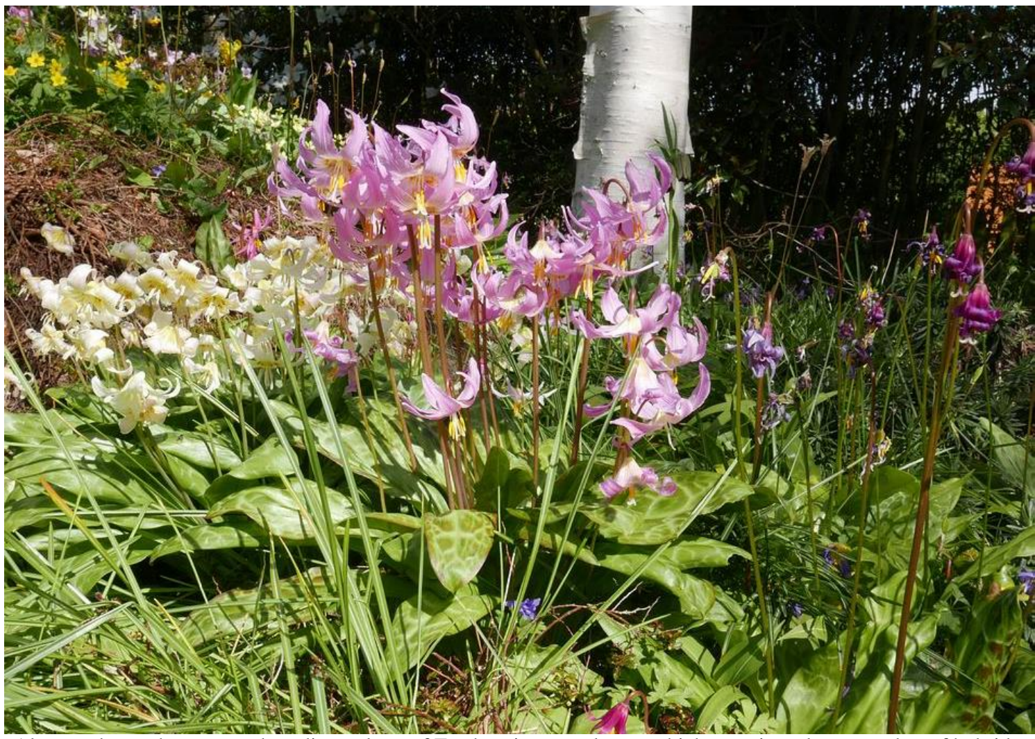
Also nearby we have a good seeding colony of Erythronium revolutum which contains a large number of hybrids.