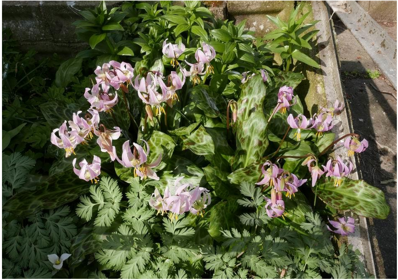
Erythronium revolutum hybrids 2&3