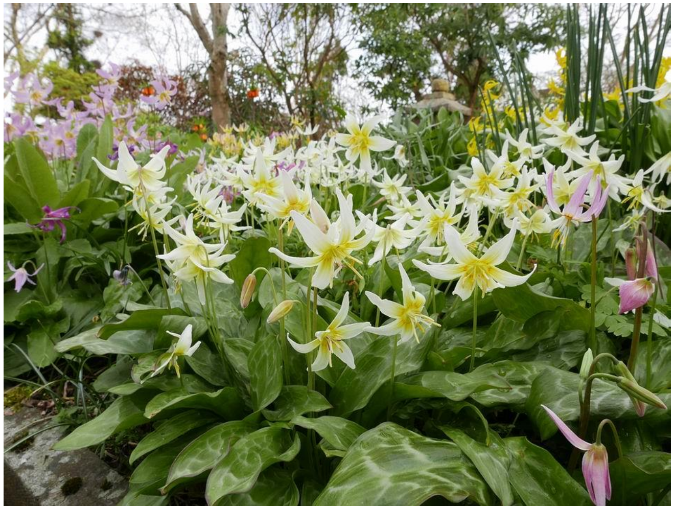
Erythronium 'Craigton Cream'