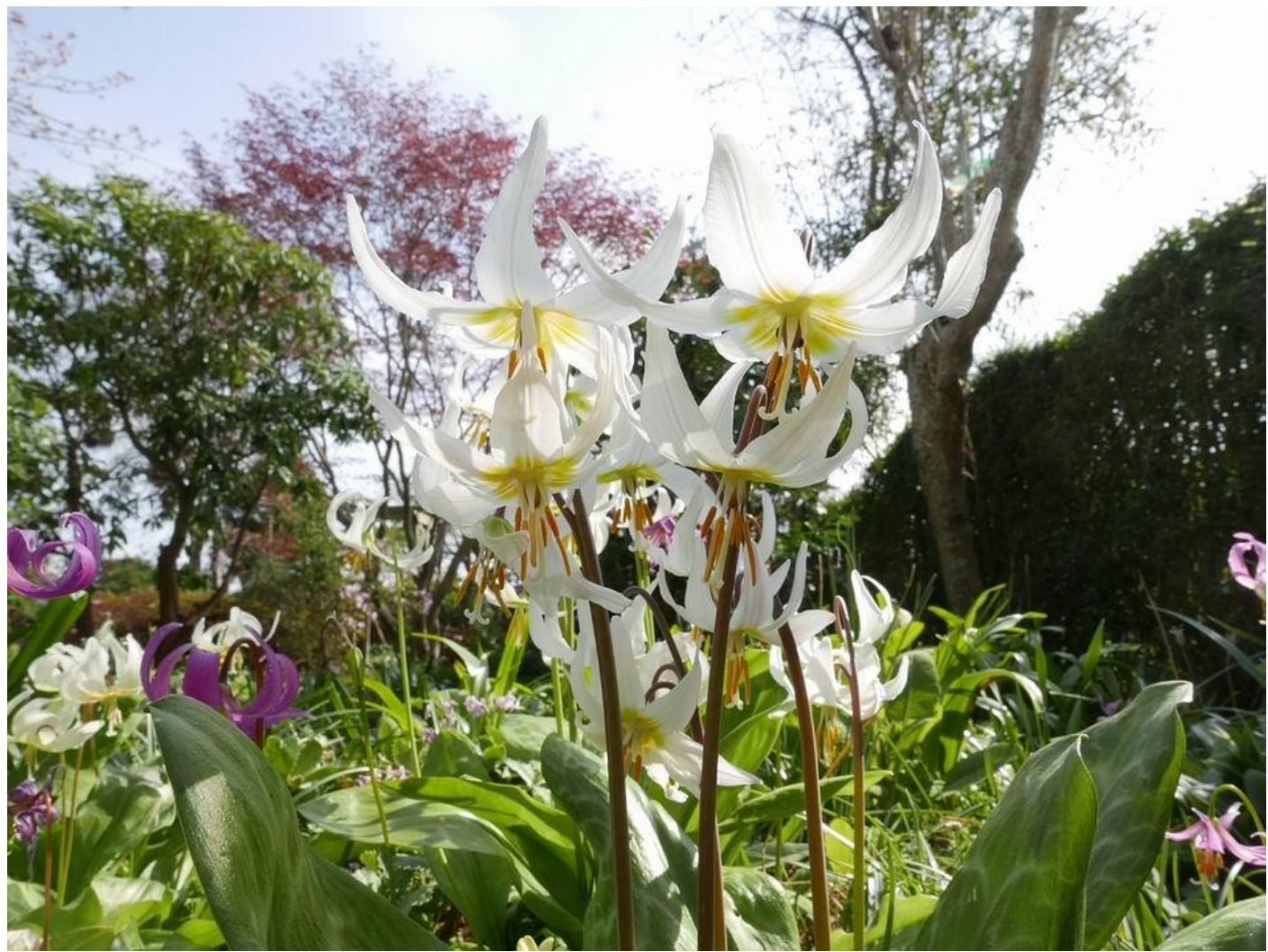
This is Erythronium oregonum growing in a plunge basket and below is a clump of hybrid seedlings deposited from this plant into the adjacent rock garden bed – note again the shape of the filaments in the species which are similar to those of Erythronium revolutum compared to the narrow shape displayed in the hybrids.