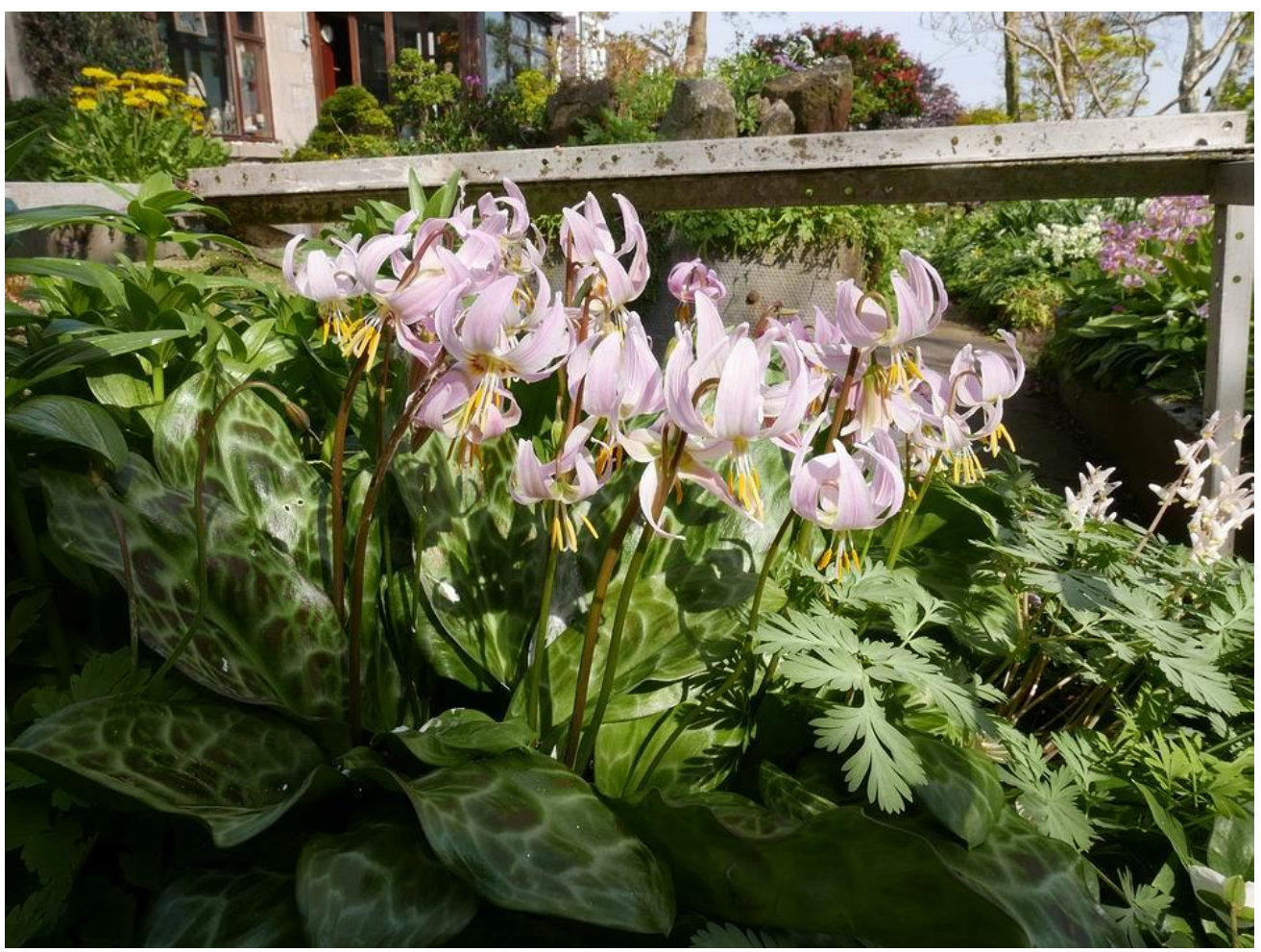
Erythronium revolutum hybrid 2

It was a combination of their well-marked decorative leaves as well as multiple flowers per stem that lead me to select these out to trial - my problem is I keep finding others that I think are potentially better. As well as the decorative values the other main criteria of a good garden plant is that it should increase to form clumps at a reasonable rate.