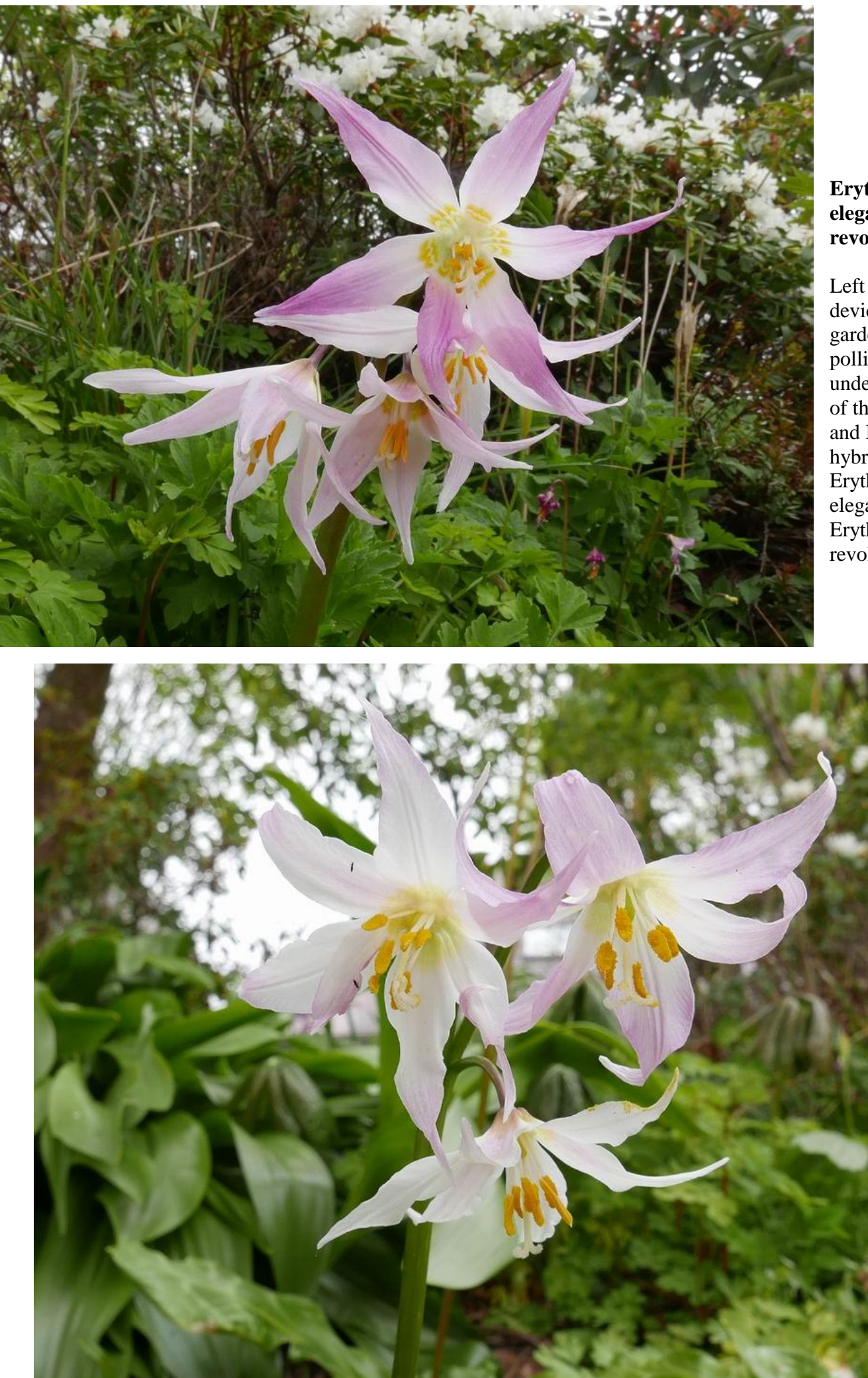
Erythronium elegans x revolutum