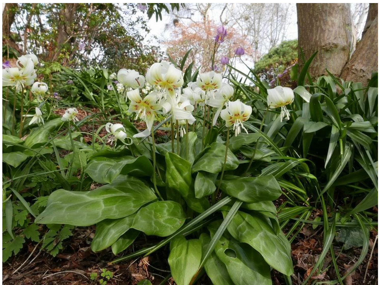
Erythronium 'White Beauty'