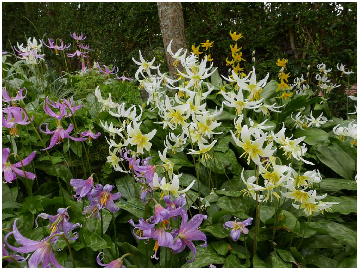
Mixed Erythronium species and hybrids