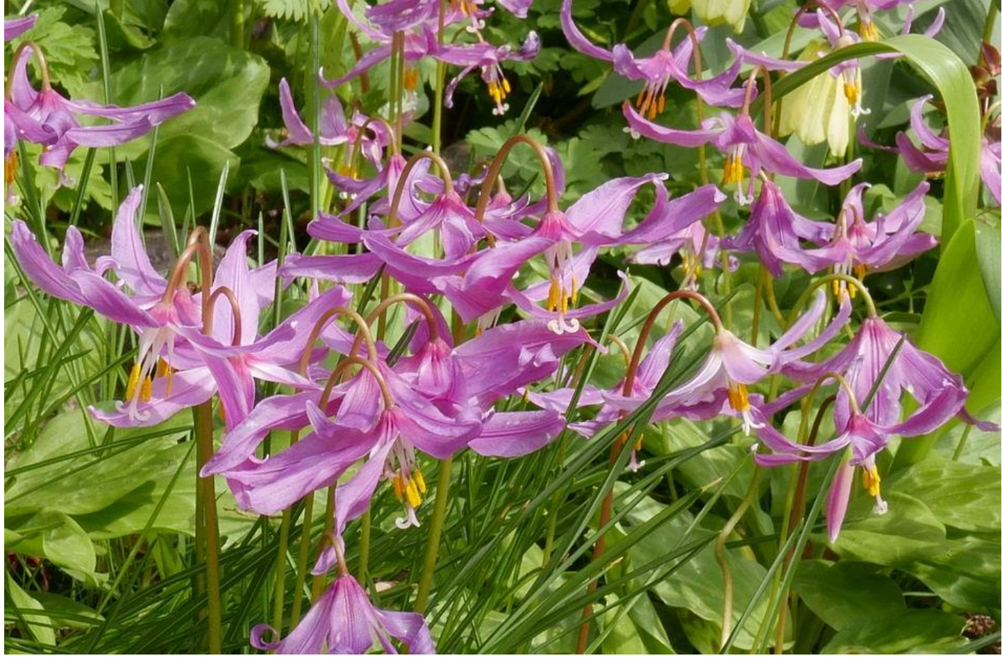
Here is another group of the more typical forms Erythronium revolutum in the garden.