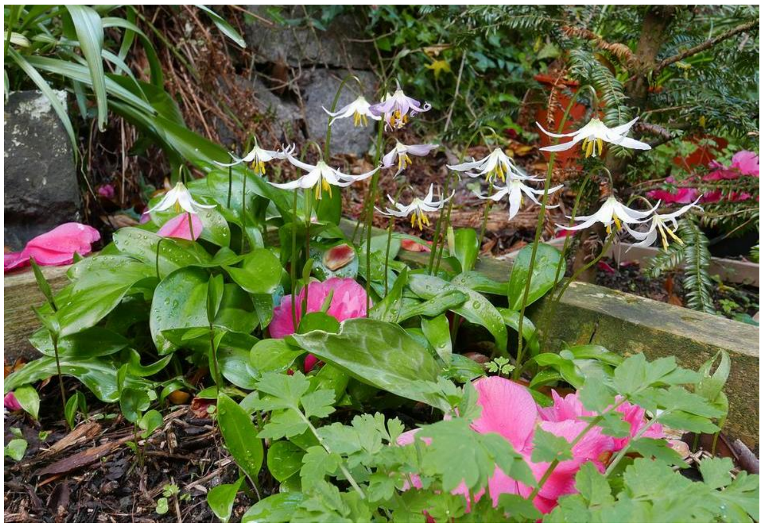
This is a group of Erythronium elegans seedlings flowering for the first time in one of the seed frames.