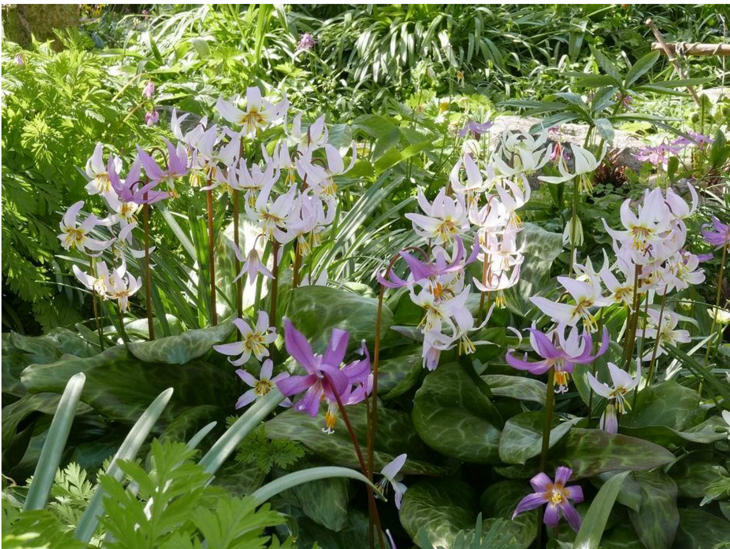
Erythronium revolutum hybrids

This grouping of Erythronium revolutum hybrids is typical of the range we have growing across the garden.