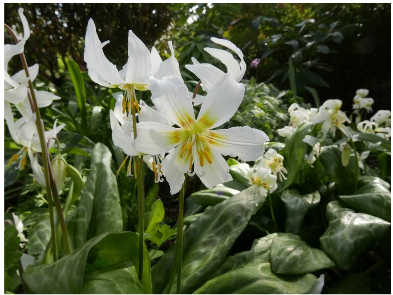
Erythronium 'White Beauty' seedlings