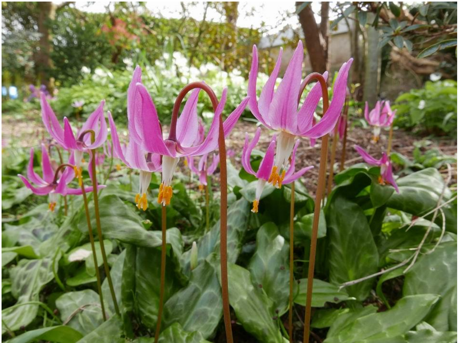
Erythronium revolutum (Lake Cowichan)