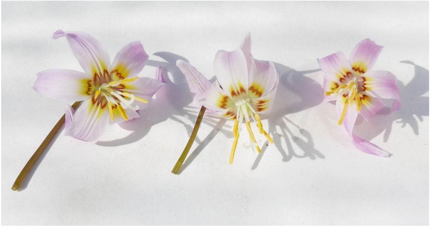
Erythronium revolutum hybrids 1, 2 &3