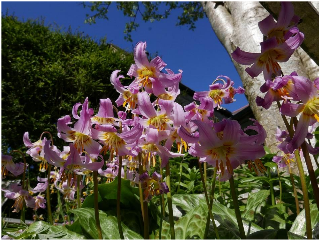
Erythronium revolutum hybrid 3

Of all the Erythronium revolutum hybrids that have occurred in our garden I have only named and distributed one ('Craigton Cover Girl') but I am continually assessing a number of others such as the three shown here which are growing in mesh baskets in a frame.