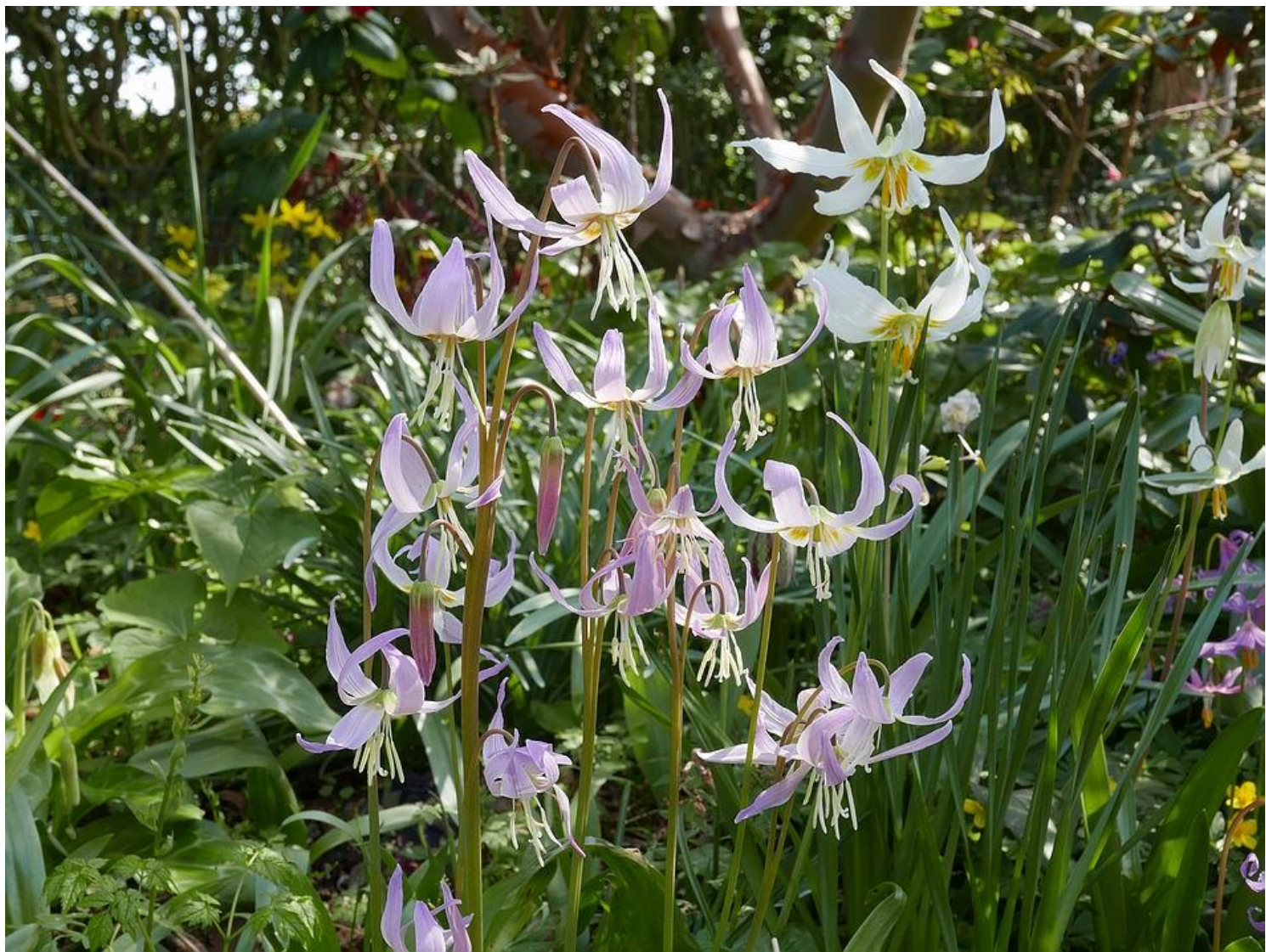
Can you spot what makes this Erythronium revolutum hybrid stand out from the others?